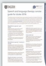
Speech and Language Specific Guide