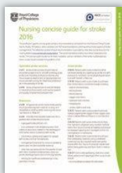
Nursing Specific Guide