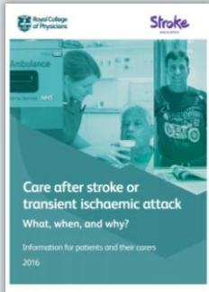
2016 Patient Guidelines

Or click here for the online version of the patient guidelines