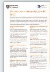
Primary Care Specific Guide