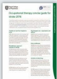
Occupational Therapy Specific Guide