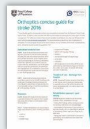
Orthoptics Specific Guide