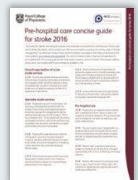
Pre-Hospital Specific Guide