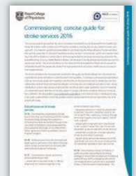
Commissioning Specific Guide