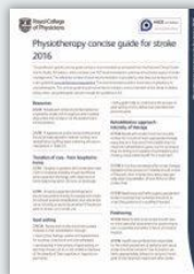
Physiotherapy Specific Guide