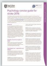
Psychology Specific Guide

Click here for the profession-specific guidelines website or click the covers below to download each guide: