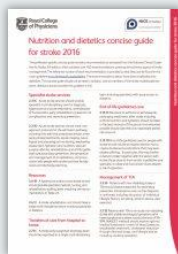
Nutrition and Dietetics Specific Guide