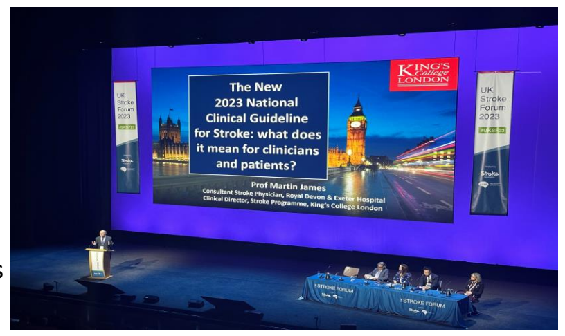
SSNAP directors presenting at the UKSF bonus plenary